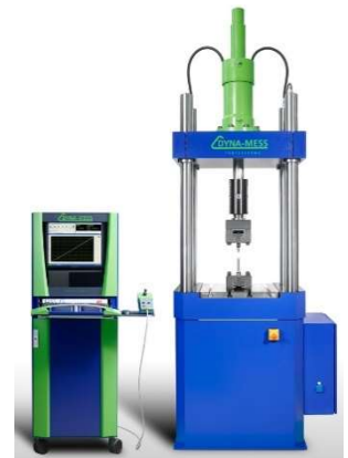
V4H 100 HCF