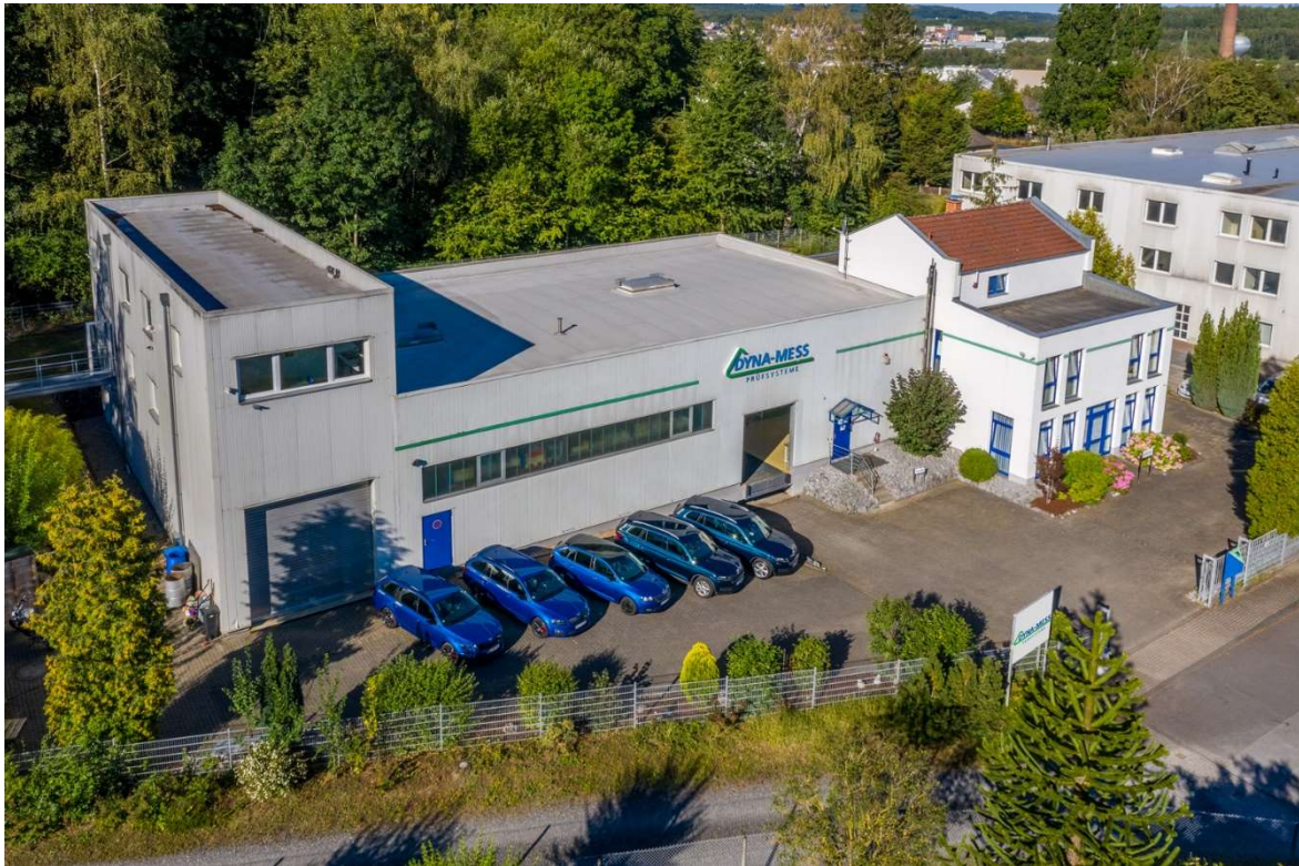
Plant DYNA-MESS Prüfsysteme GmbH in Stolberg/Aachen

DYNA-MESS Prüfsysteme GmbH was founded in 1985 in Aachen. The company designs and produces machines (tension, compression, bending and torsion) as single or multi axis machines for static and dynamic testing of materials and components.