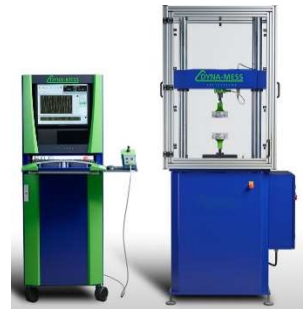
V2H 20 HCF